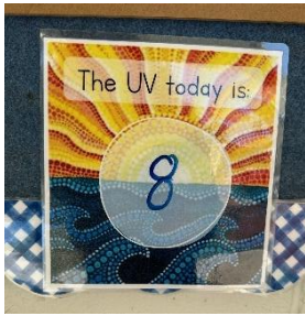
UV Chart found at Welcome Table